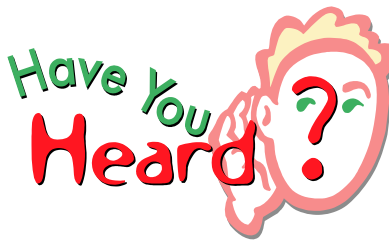
Things are happening at Fly Nazarene!

Now, sit back, have a cup of coffee (or tea!) and enjoy the Good News from Fly .